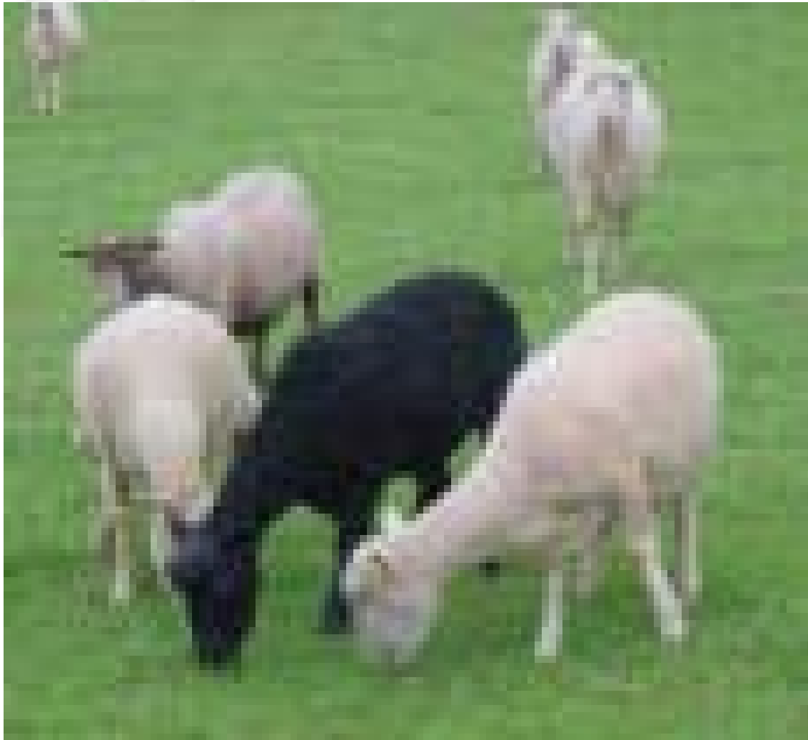
IWTO Conference Evian 2004